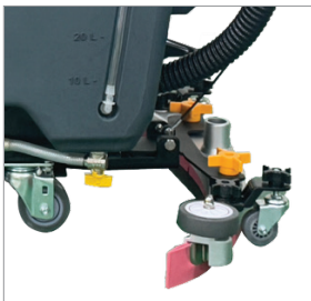
Wet Pick-Up Squeegee