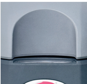
Easy Tank Filling Access