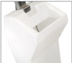
Large Solution Tank