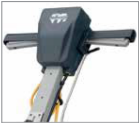
Simple to Use Operator Handle