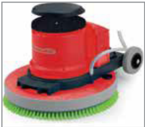
Optional Hi-Dust Filter